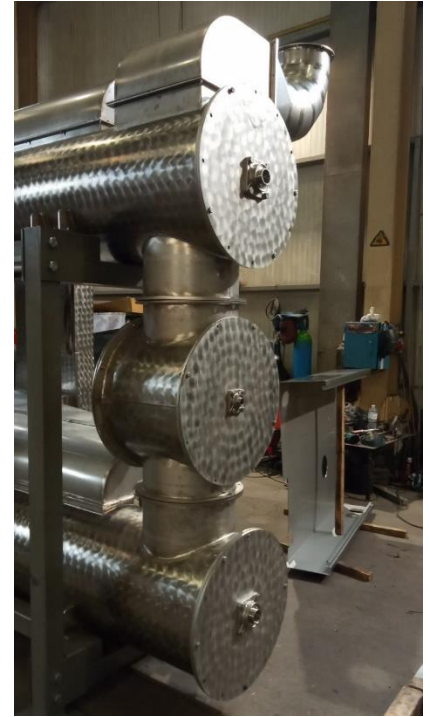
Connection point of two modules