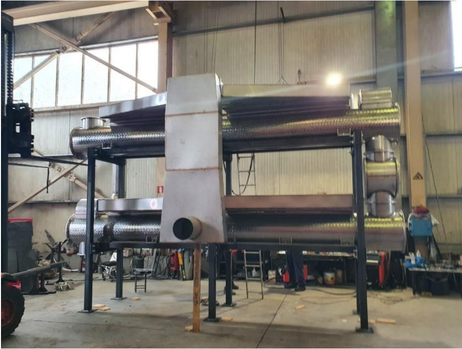
The dryer with the rack and the air inlet system