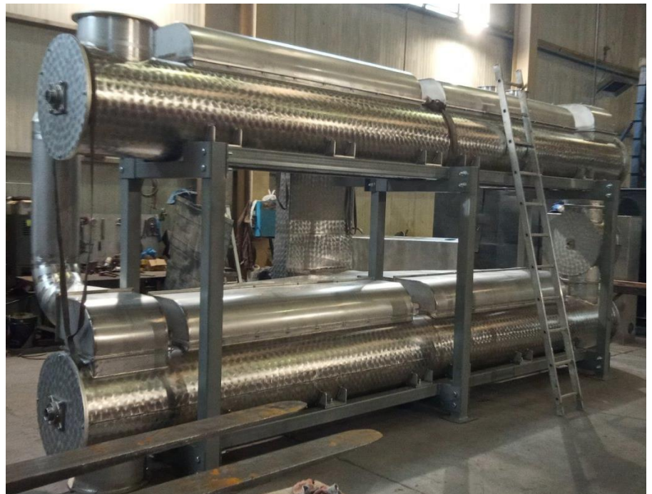
The two modules of the dryer